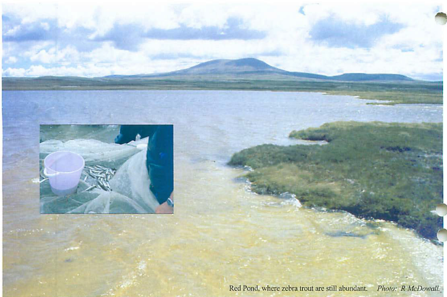
Red Pond, where zebra trout are still abundant.